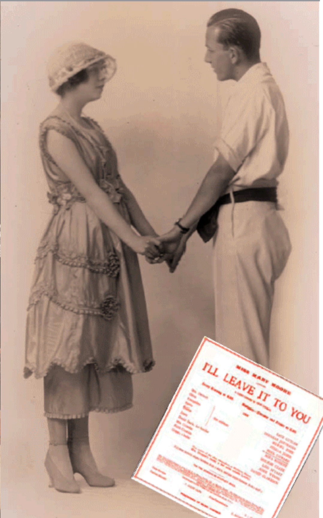
Main shot: Esme Wynne as Faith Crombie and Noël Coward as Bobbie Dermott in I'll Leave It to You , 1920.